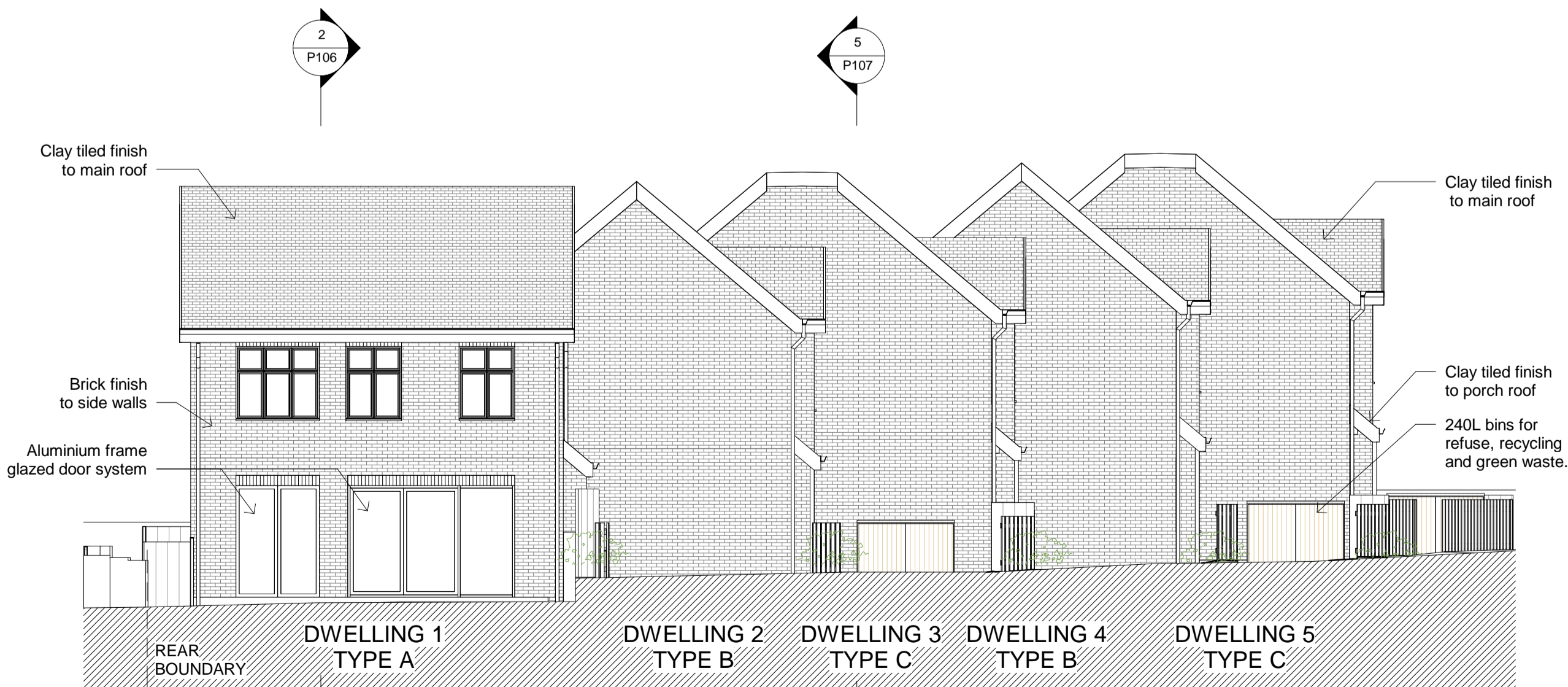
3 SIDE ELEVATION (WEST) P105 1: 100