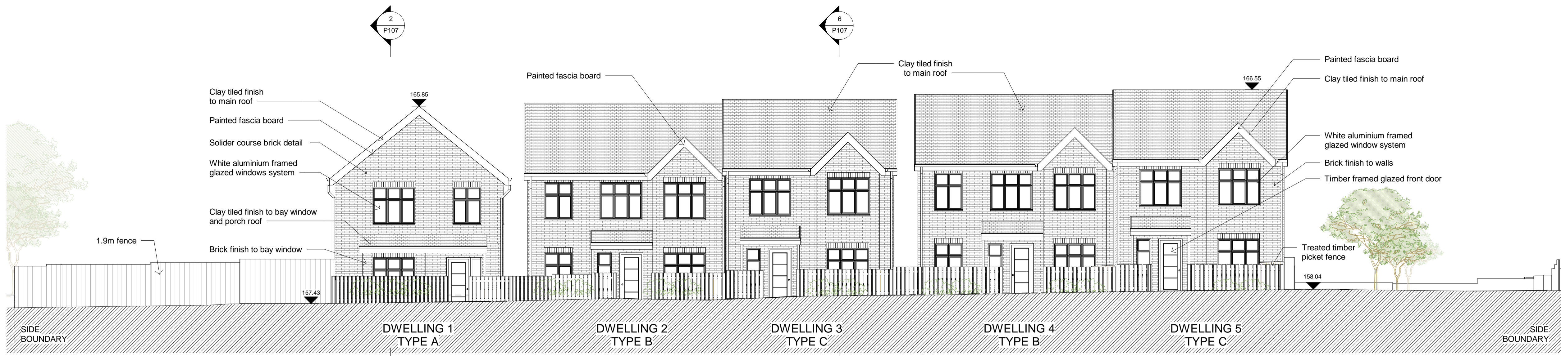
1 FRONT ELEVATION (SOUTH) P105 1: 100 @ A1

This drawing is copyright of PML Architecture. This drawing must be read in conjunction with the Designer's Risk Assessment, specification and all other relevant documentation and drawings. PML Architecture accept no liability for any expense, loss or damage of whatsoever nature and however arising from any variation made to this drawing or in the execution of the work to which it relates which has not been referred to them and their approval obtained. Do not scale from this drawing or the digital data, only figured dimensions are to be used. For Planning refer to linear scale. Check all dimensions on site prior to carrying out any works - advise any discrepancy