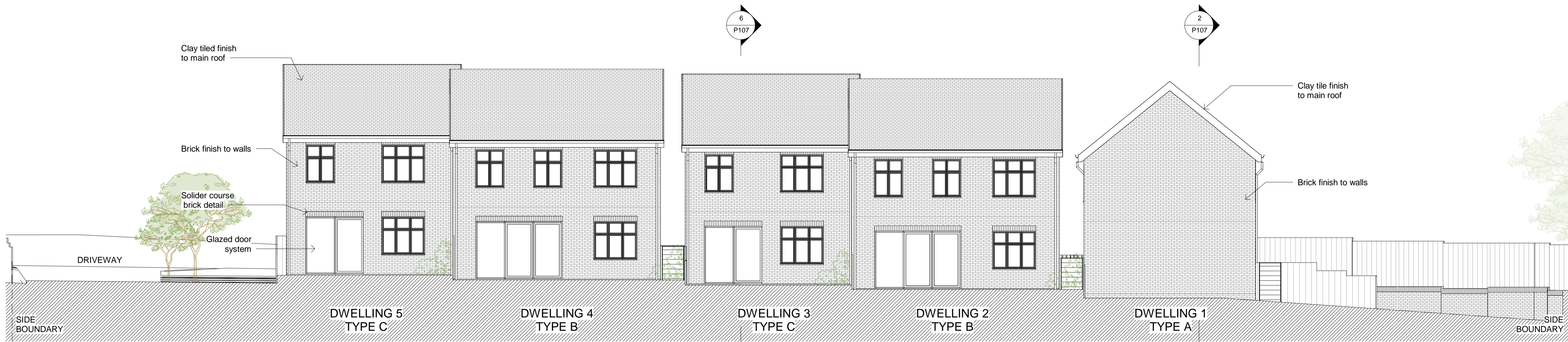
2 REAR ELEVATION (NORTH) P105 1: 100 @ A1