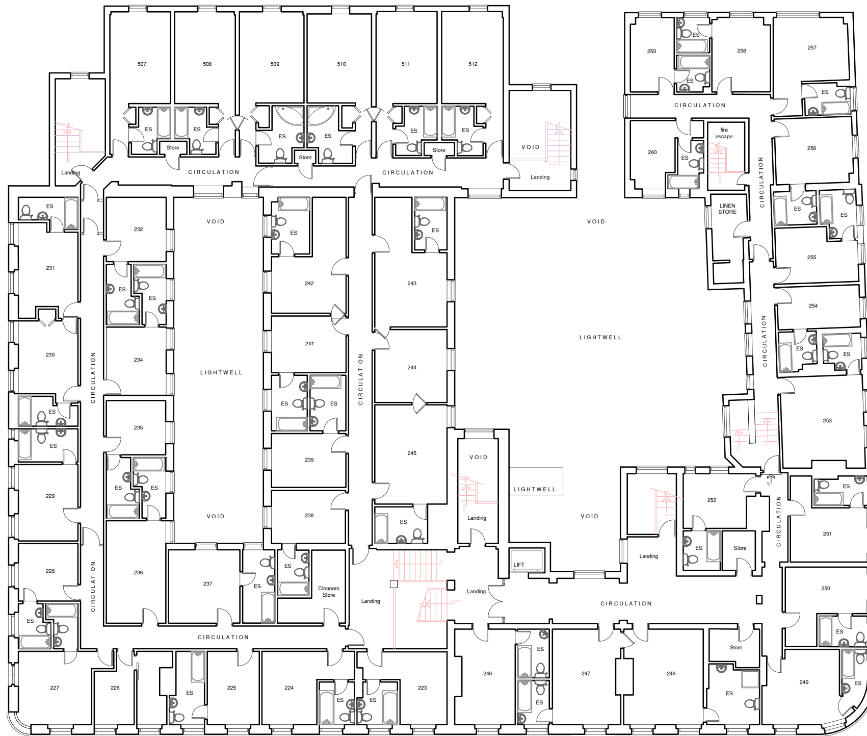
EXISTING SECOND FLOOR LEVEL