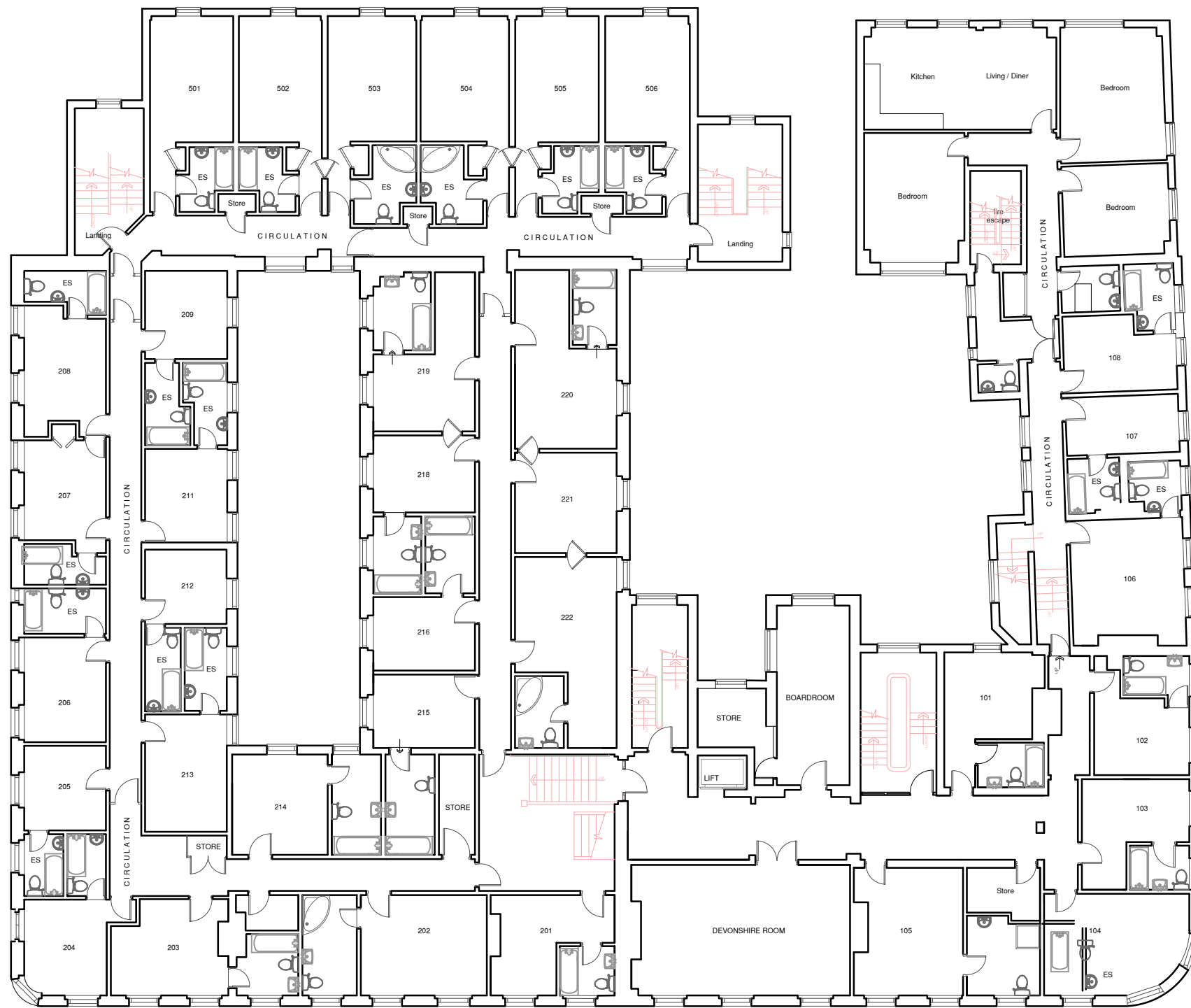
EXISTING FIRST FLOOR LEVEL